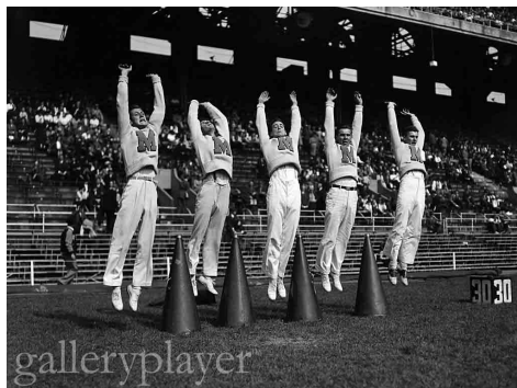
SAW 100 Club –

Having said that, it should be a great day out and it will be nice to meet up with writing friends in the North for a change. Anyone with a National Entitlement Card (fka Bus Pass) will be able to travel there free by bus. Many of us are thinking of travelling up on the Friday night and staying over and there is reasonable accommodation available if booked early enough.